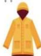
Raincoat or umbrella