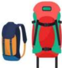
Rucksack + Backpack