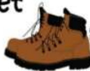
Shoes with good ground grip

i.e. Jacket, Gloves, Cap, Muffler, Socks