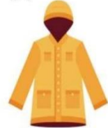
Raincoat or umbrella