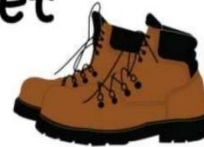
Shoes with good ground grip

i.e. Jacket, Gloves, Cap, Muffler, Socks