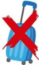
No Trolley Bags