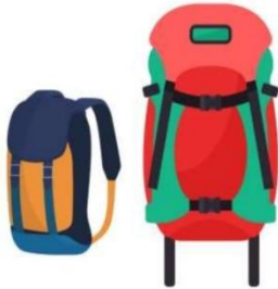
Rucksack & Backpack