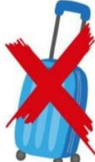
No Trolley Bags