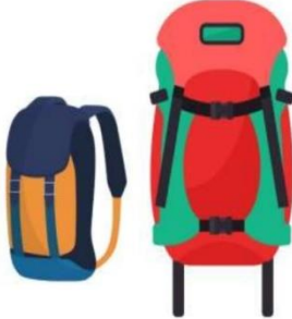
Rucksack & Backpack