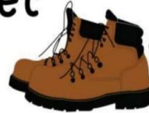
Shoes with good ground grip

i.e. Jacket, Gloves, Cap, Muffler, Socks