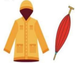
Raincoat or umbrella